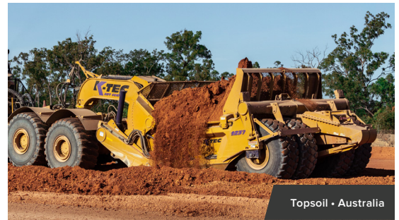
Topsoil • Australia