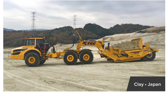
Clay • Japan