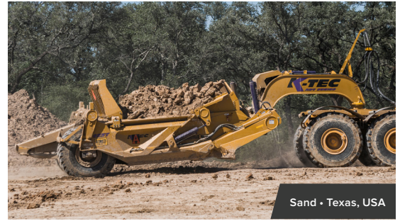
Sand • Texas, USA

Specifications are subject to change without notice.