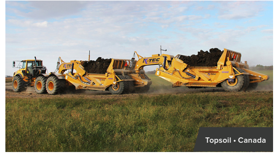
Topsoil • Canada