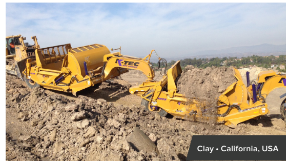
Clay • California, USA