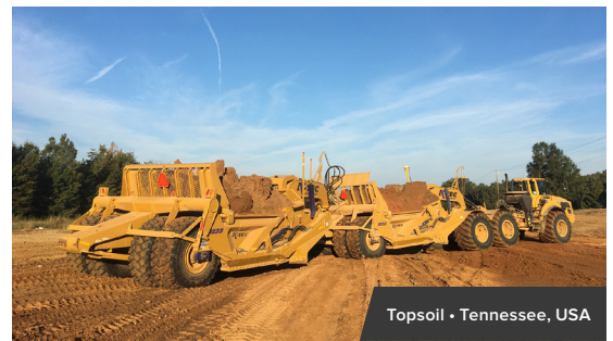
Topsoil • Tennessee, USA