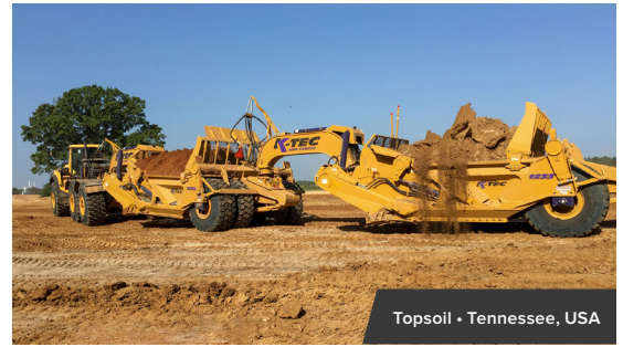
Topsoil • Tennessee, USA

Specifications are subject to change without notice.