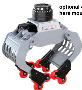
optional 4-Grip gripping device, here mounted to a D04H