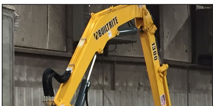
Remote Controlled in climate controlled operator's station. Power unit is remoted mounted. 26' 4"(8.0M), hip (gooseneck) styled boom for loading and tamping solid waste.