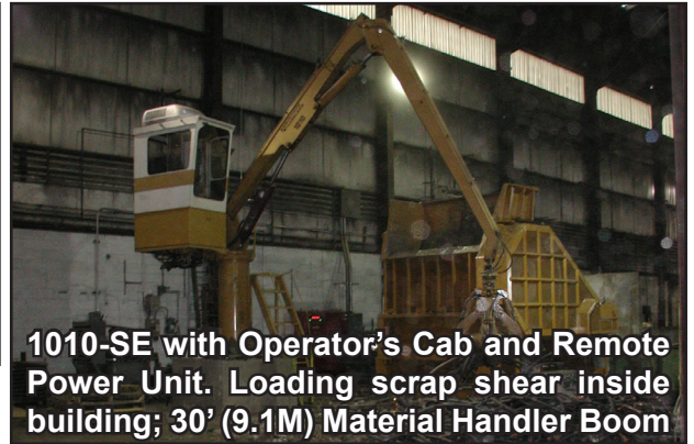
1010-SE with Operator's Cab and Remote Power Unit. Loading scrap shear inside building; 30' (9.1M) Material Handler Boom